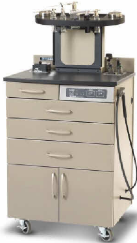
Model 310 Narrow in Shadow Laminate

Overall Height: 48" Height to Work Surface: 35" Width: 25" Depth: 20 7/16" Shipping Weight: 220 lbs.