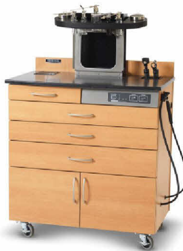
Model 410 in Natural Pear Laminate

Overall Height: 48" Height to Work Surface: 35" Width: 33" Depth: 20 7/16" Shipping Weight: 245 lbs.