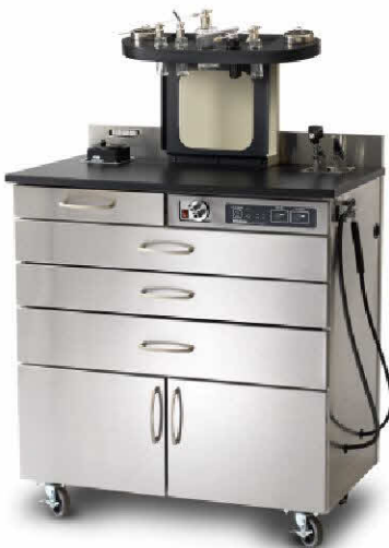
Model 510 in Stainless Steel

Overall Height: 48" Height to Work Surface: 35" Width: 33" Depth: 20 7/16" Shipping Weight: 275 lbs.