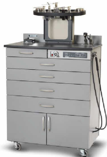
Model 610 Tall in North Sea Laminate

Overall Height: 58" Height to Work Surface: 45" Width: 33" Depth: 20 7/16" Shipping Weight: 300 lbs.